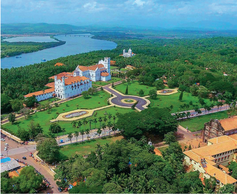
Fig. 7. Goa World Heritage promenade.

of the Catholic religion in the Asian world in the modern period.” Clearly, the declaration values the spiritual presence of the saint over Goa’s material assets. Complementing this statement, the argument foregrounding the spread of Catholicism in Asia is reinforced in other parts of the declaration, e.g., “The monuments of Goa, ‘Rome of the Orient,’ exerted great influence from the 16th to the 18th century on the development of architecture, sculpture and painting . . . throughout the countries of Asia where Catholic missions were established.” These monuments are also said to be “an outstanding example of an architectural ensemble which illustrates the work of missionaries in Asia.” This wording had necessarily come out from the proposal submitted to UNESCO by the Republic of India’s government. 19