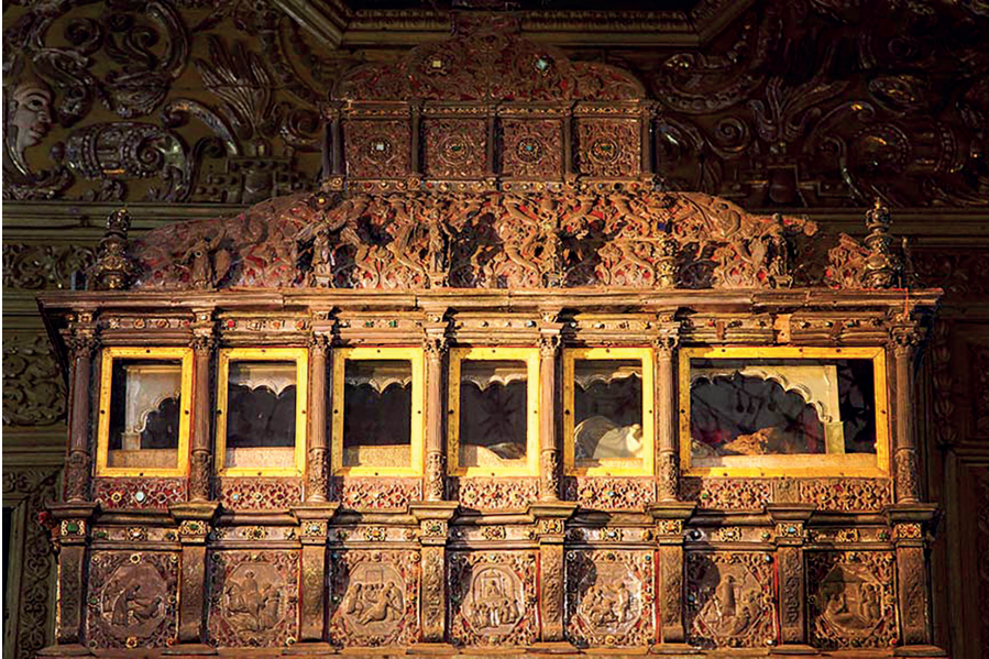
Fig. 6. St. Francis Xavier's casket at the Bom Jesus Church in Goa, 2017