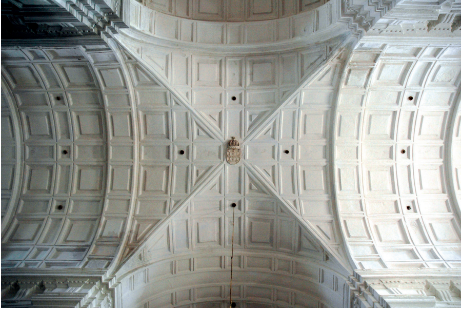
Fig. 5. Goa cathedral's crossing vault, 2013.