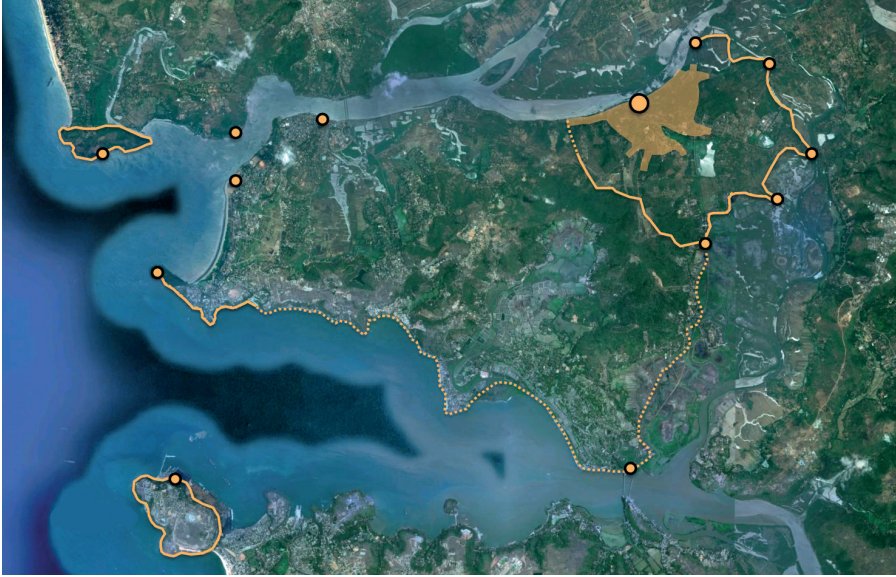
Fig. 2. Goa and Tiswadi Island's geographic shape and defensive system (in Rossa and Mendirata, "A cerca adormecida," 2012).

Cochin, whose authorization for the establishment of a Portuguese city was given by the local sovereign in 1503, only five years after the arrival of the Portuguese ships in the Indian Ocean, was almost a natural choice for the settling of the main Portuguese base. Even so, the decision was not immediate. It should be noted, for example, that in 1506 the king wrote to the Viceroy Francisco de Almeida, ordering him to decide on that "main base" and suggesting its location in Sri Lanka, as the island was "at the center of all the fortresses and things we own there" (Santos 1999, 90; my translation). Even before being seized in 1510 from the Sultanate of Bijapur, under the command of Afonso de Albuquerque, Goa emerged as a possibility in that discussion. The strategic context that influenced the decision and subsequent military actions led by that eminent Portuguese viceroy (1509–15) is well known, basically consisting in the opportunity to control Indian Ocean routes and trade by taking possession of the main ports of Goa, Ormuz, and Malacca, along with a few of secondary importance. s