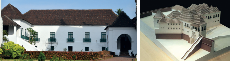
Fig. 4. Archbishop's Palace, 2017; Model of the Viceroy's Palace, Fundação Oriente Museum, Lisbon.

governors or viceroys and to make the city rhetorically worthy of its status as a Portuguese political, religious, and (essentially) trading capital city in Asia. And, to be clear, like Lisbon and contrary to what is commonly asserted, except for its churches Goa was not a city of monumental or even high-quality architecture. The same applies to its town planning and infrastructure (Rossa 2018).