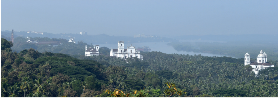
Fig. 1. The view of Goa from the Lady of the Mount Hill, 2017.

Republic of India, Panjim, eight kilometers down the Mandovi River, emerged as the new center of power.